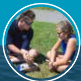
We Preserve OUR WATERWAYS